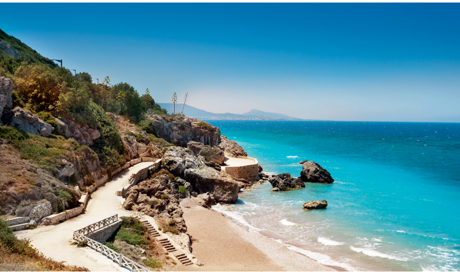
Kato Petres: attractive landscape and ideal climate ... like everywhere else in the area

It does not have to be a conflict if somebody is "the Greek" in Germany and "the German" in Greece. This can even be considered as an advantage in sales negotiations. I